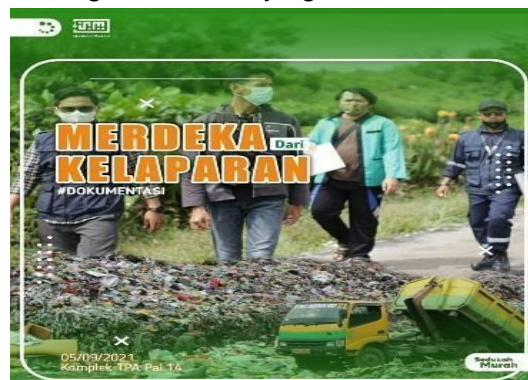
Figure 3. Surveying the locations

The second phase involves surveying the locations of potential recipients of the "Community Rice Barn." During this stage, the mosque's leader assigns mosque volunteers or members to survey where potential recipients reside. It involves conducting interviews and collecting comprehensive biodata from potential recipients, which is needed for the "Community Rice Barn" acceptance files. The objective is to ensure that the "Community Rice Barn" recipients are genuinely in need, particularly those who have been economically and physically impacted by the COVID-19 pandemic. Surveys and interviews aim to identify and prioritise deserving recipients.