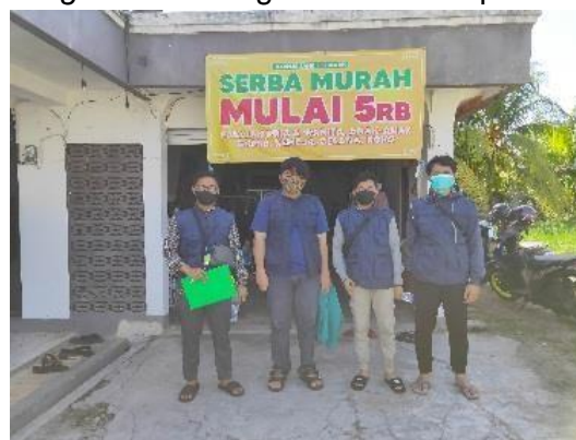
Figure 2. Finding Potential Recipients

The first step entails visiting various locations near the mosque base camp to identify targets or potential recipients. The mosque leader can appoint teams to observe these locations. Aside from identifying potential recipients through on-site observations, recommendations can also come from the mosque and neighbourhood chiefs (RT or RW), recommending communities affected by the COVID-19 pandemic who are eligible and considered economically disadvantaged to receive the "Community Rice Barn." Donors who trust the mosque's efforts fund the "Community Rice Barn" to be distributed to the community. Donations are collected through Infaq and contributions, both online and offline. The funds are then utilised to purchase rice for distribution to the community.