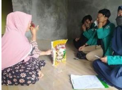
Figure 4. Distribution Process 1