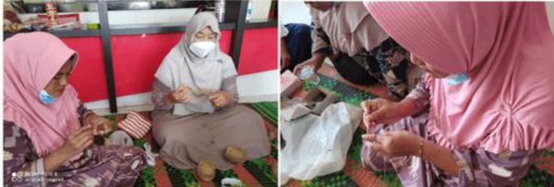
Figure 3. Knitting Process

The image above illustrates the stages of the technique used in practicing the creation of knitting products, taught by the Head of Community Service, who also served as the training facilitator. Subsequently, the resulting products can be seen in the image below.