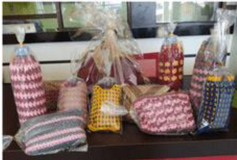
Figure 4. Knitted Products

Regarding Figure 4, the products were created by trained participants who were partners in the community service activities. These products are ready to be marketed through conventional and online channels. The proceeds from the sale of these products contribute to the economic well-being of the PKK Members in Gampong Sungai Pauh Pusaka, Langsa City. The final stage involves Monitoring and Evaluation. During this phase, the team distributed a five-question satisfaction questionnaire and used a Likert scale measurement with response options ranging from 1 to 4 (1=very unsatisfied; 2=unsatisfied; 3=satisfied; 4=very satisfied). This questionnaire was given to all 20 participants in the activity. To ascertain the results of the questionnaire distribution, refer to Table 2.