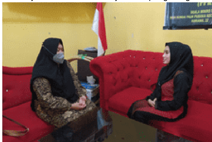
Figure 2. Community Service Team Survey in Gampong Sungai Pauh Pusaka

Next is the Training Stage, where the community service team carried out several processes to explain the knitting product creation to the PKK Members of Gampong Sungai Pauh Pusaka. The scheduled activities are listed in the table below.