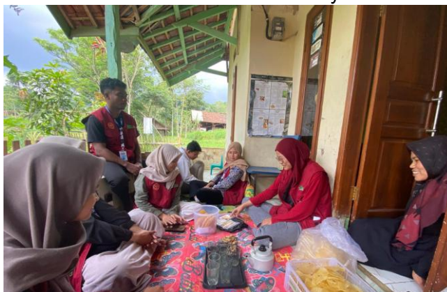
Picture 1. MSME Survey

This community service activity was carried out in Mekarjaya Village, with the main target being MSME actors in 13 RW. Mekarjaya Village has various types of MSMEs that produce processed agricultural products such as coffee, sweet potatoes, handicrafts, and other processed products such as opak aci, peyek, and brownies. This product diversity is a great potential that can be developed. Initial surveys conducted by the KKN student team in the first week per RW showed that the majority of MSME actors, especially micro-enterprises, do not yet understand about business development, especially the importance of attractive packaging and the use of digital media in marketing.