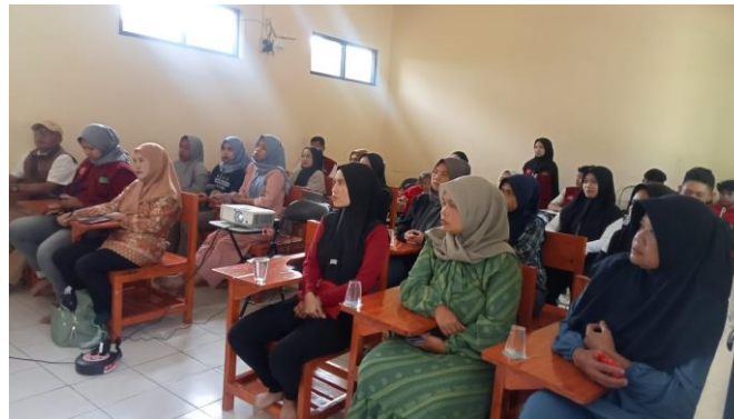
Picture 2. MSME Socialization Activities