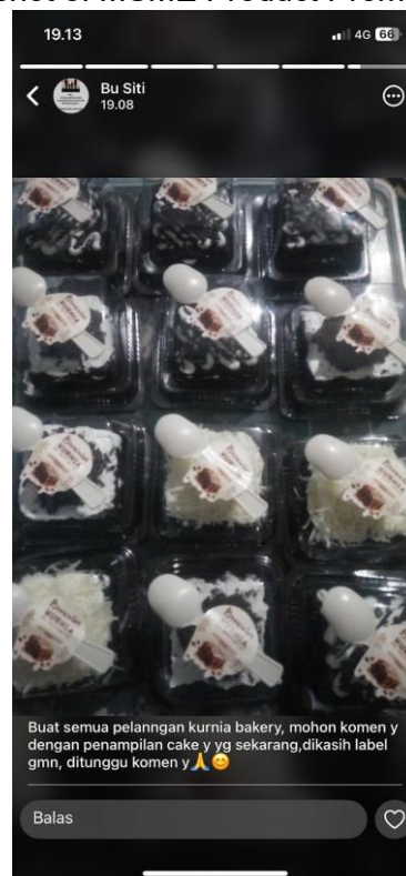
Figure 4. Screenshot of MSME Product Promotion via Facebook

After the training, MSME actors were able to create packaging designs with product brands, compositions, variants, and easily contactable contacts. Online marketing assistance was focused on WhatsApp and Facebook platforms, according to local access and habits. Monitoring for two weeks after mentoring showed a 20% increase in sales at kicimpring MSMEs, expansion of peyek market to outside the village through Facebook, and addition of new brownies customers through WhatsApp.