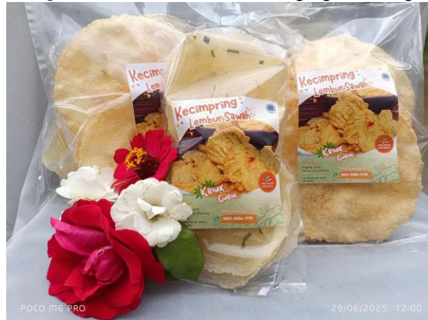
Figure 3. Product After Packaging Labeling

Intensive training and mentoring were provided to three selected MSMEs in the fields of kicimpring, peyek, and brownies, with a focus on improving product visuals through packaging labels and online and offline marketing strategies. Previously, promotions and sales were only done traditionally without attractive packaging. The training also taught the selection of packaging that considers aesthetics and product safety with limited capital considerations.