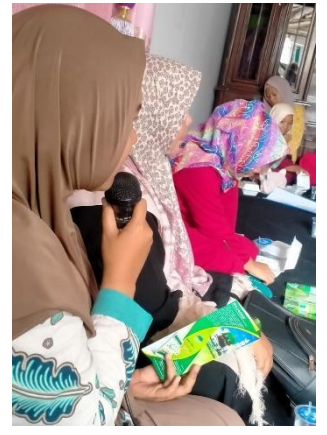
Figure 3. Presentation of Material

Before commencing the material presentation process, the presenter first distributed brochures to the participants of the socialization. Following this, the material presentation and discussion session were conducted. The material presentation was aimed at providing explanations to the participants, the women who regularly attend sermons in Desa Rowotapen, regarding the deposit products and types of financing available at the KSPPS BMT NU Branch Tanggul.