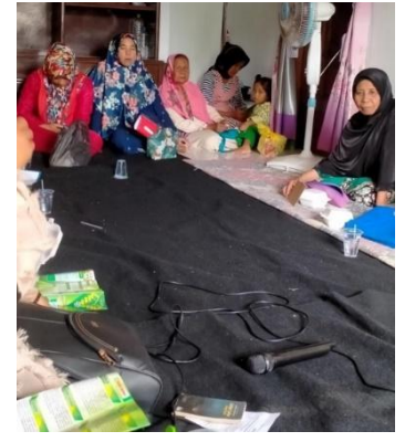
Figure 4. Listening to the Presentation of Material

The participants of the service were very enthusiastic in listening to the presented material and actively participated in the question-and-answer session. This was evident in the way they posed questions regarding the topics discussed. The participants gained awareness and knowledge regarding financial institutions, especially those based on Sharia principles, which greatly influences the economic growth and well-being of the community in Desa Rowotapen Tanggul Wetan.