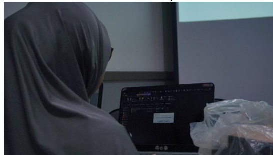
Figure 2. Installation & Basic Operations of MAXQDA