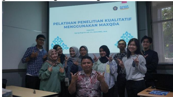
Figure 4. Ending of Training Session of MAXQDA

(Harahap, 2020). Participants applied this model to interpret their findings and present them in structured formats suitable for academic writing.