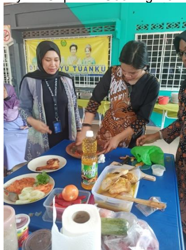
Figure 4. Ayam Geprek's Cooking Demonstration

Cooperation between restaurant owners, cultural communities, and local governments is also strengthened through this project, bringing long-term benefits in promoting Indonesian cuisine and introducing culinary culture internationally. In addition to the direct impact, the project also has the potential to open up opportunities for the development of cultural tourism in Malaysia, supporting the growth of the local tourism industry. Finally, by introducing and promoting Ayam Geprek in Malaysia, the project can strengthen the relationship between Indonesia and Malaysia, particularly in the cultural and culinary context. These results are the first step in building a deeper understanding of how cuisine can act as an essential medium in introducing and connecting different cultures at the international level. It is hoped that the project will provide long-term benefits for both countries and enrich the experience of international tourists in Malaysia.