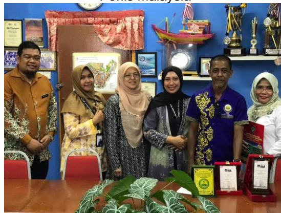
Figure 3. Collaboration Institut Teknologi dan Bisnis Asia Malang Indonesia with Rainbow Village Perlis Malaysia

The purpose of this meeting was to introduce project ideas and discuss the best way to integrate cultural elements in the archipelago's culinary Ayam Geprek. Based on the