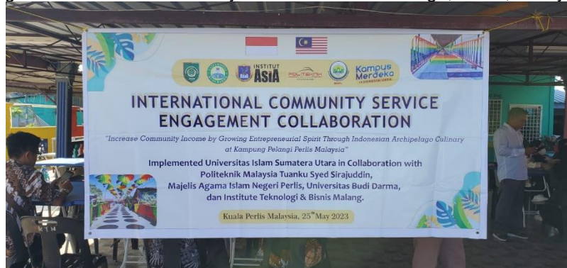
Figure 1. Place of Community Service Rainbow Village, Perlis, Malaysia

The implementation of community service activities includes a series of carefully planned stages. Here are the details of how this activity will be run: