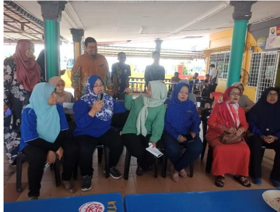
Figure 5. The Enthusiasm of Community Service Participants