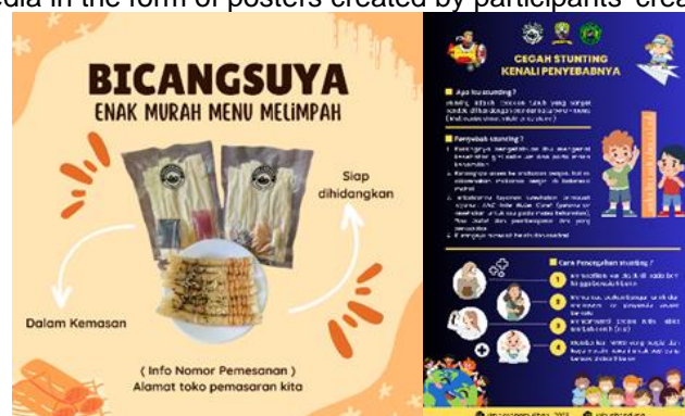
Figure 7: Learning media in the form of posters created by participants' creativity during the training

Universally, the workshop activities proceeded very well. Participants were highly enthusiastic and attentive to the presented material. They followed each training step according to the guidelines provided by the facilitators. Participants effectively created PowerPoint presentations, with many seeking clarifications on various aspects. This demonstrates their genuine interest and enthusiasm in producing their work.