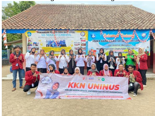
Figure 8. After Training

The results of this preparation initiative will be assessed through surveys focusing on program achievements and progress in addressing additional issues. The targeted accomplishment was for 80% of educators to be proficient in configuring instructional media using Microsoft PowerPoint and the Canva Platform. This goal can be achieved as the program is executed as planned. Approximately 85% of the teachers at Lembang Public Elementary School can now create more engaging learning materials using Microsoft PowerPoint and the Canva Platform. Upon completing the CSA activities, instructional media based on Microsoft PowerPoint and the Canva Platform are believed to be usable by educators in teaching and learning exercises.