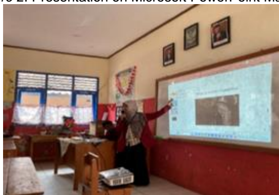
Figure 2. Presentation on Microsoft PowerPoint Material

The community service activity was attended by 10 teachers from Lembang Public Elementary School. The training took place on Wednesday, August 22, 2023. The session began with presentations from the speakers on Microsoft PowerPoint and Canva, followed by hands-on practice.