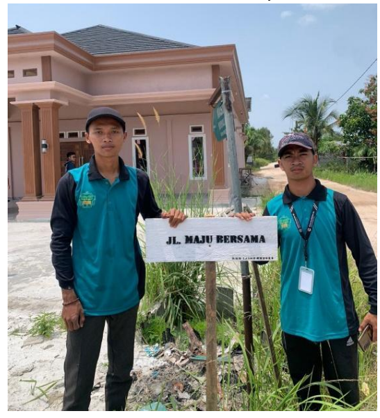
Figure 2. Results of Street Nameplate Installation