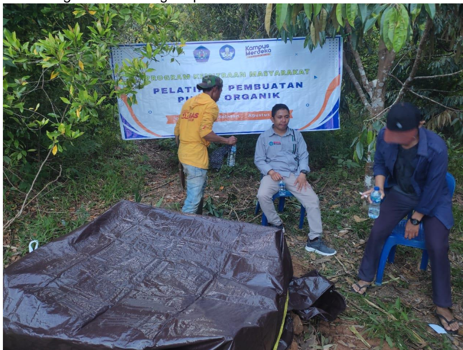
Figure 6. Installing Tarpaulin for the Fermentation Process