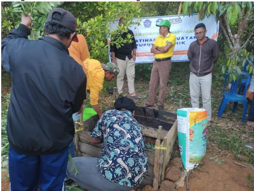
Figure 4. Fertilizer Manufacturing and Fermentation Process