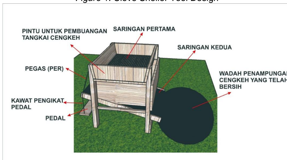
Figure 1. Clove Sheller Tool Design

Farmer productivity is crucial. The higher the level of farmer productivity, the higher the income from the farmers. One of the drivers of increased farmer productivity is the use of time. With the help of technology, farmers can shorten working hours so they can complete several activities in a short time. Human resources (HR) are the most important capital and wealth of every human activity. Humans as the most important element must be analyzed and developed in such a way. Time, energy, and their abilities can be fully utilized optimally for the benefit of the organization, as well as for individual interests. As the first and main factor in the development process, HR is always the subject and object of development. The level of labor productivity plays a very important role in national economic growth, where national and regional income is largely obtained by improving the quality of HR (Oktavia et al., 2017).