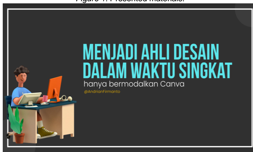
Figure 1. Presented materials.

Considering the training and mentoring time required to create beautiful and attractive CANVA graphic works, which can be used as promotional tools for women entrepreneurs in Ngenep Village, Karangploso, this Community Service activity is planned to last for nine months. During the first two months, the team will focus on brainstorming ideas, offering forms of workshops/mentoring on graphic design through CANVA, and proposing funding. The next three months will be dedicated to the implementation of activities, followed by evaluation and the writing of community service reports and outputs. The materials presented in this Community Service activity are as follows: