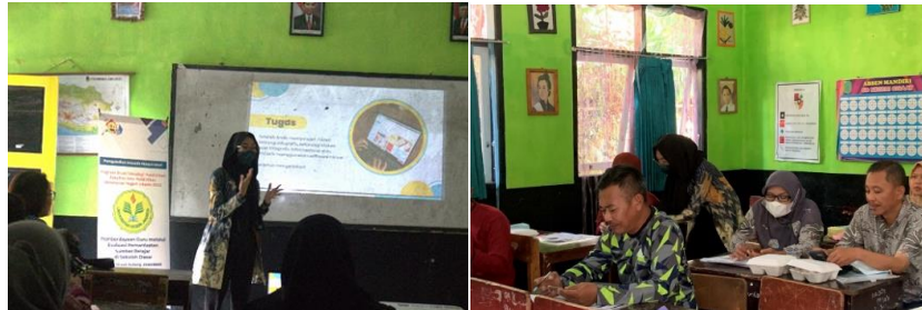
Figure 3. Teachers presenting developed infographics