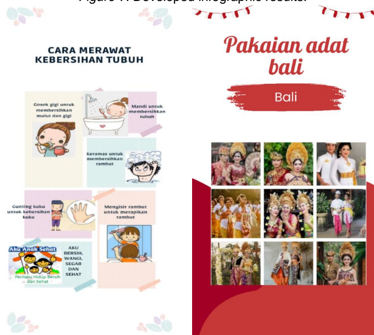
Figure 7. Developed infographic results.