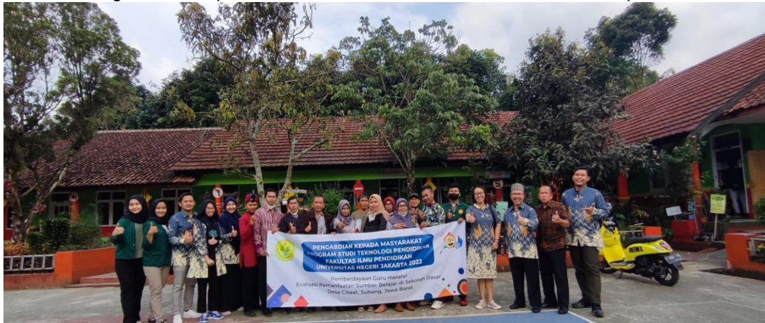
Figure 6. Group Photo with Lecturers, Students, and PKM Participants

This stage is a formal termination of the relationship with the target. This activity was formally conducted on August 16, 2022. In this activity, the participants gave positive feedback and expressions of gratitude for the implementation of the PKM, both directly (verbally).