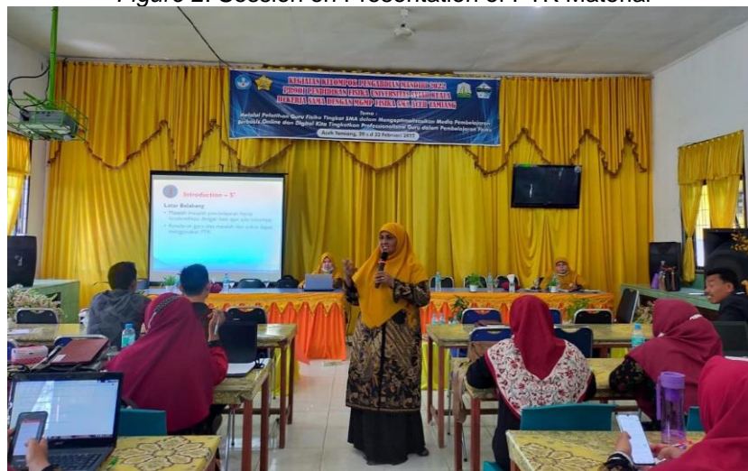
Figure 2. Session on Presentation of PTK Material

The implementation of the Community Service Independent Program involves providing training and mentoring in the preparation of Classroom Action Research (PTK) for physics teachers in Aceh Tamiang. This activity took place on February 21-22, 2022, at Kejuruan Muda Vocational High School 2. There were 47 participants in this activity who work as physics teachers in the Aceh Tamiang Regency. Throughout the activity, participants were given insights into the benefits of Classroom Action Research (PTK) for improving learning, as well as training on how to write and compile PTK reports. It is hoped that after completing this training, teachers will be able to create a PTK that is ready for publication. Furthermore, with this training, it is hoped that the educational field will be enriched as more teachers publish their efforts to improve the learning process.