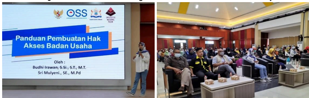
Figure 2. OSS RBA Training Activities for MSMEs in Cimahi City

The training activities for creating access rights and business permits or business registration numbers through OSS RBA were conducted at the Techno Park Building in Cimahi City, West Java, attended by 115 MSME participants with individual and corporate business types. With an average low risk level, 80% of training participants were able to take home their Business Registration Numbers printed during the training, along with training certificates, while the remaining 20% were hindered by administrative issues with population records that were not integrated with the system, as well as some participants who wanted to migrate from OSS version 1.1 to OSS RBA but forgot their old account usernames and passwords.