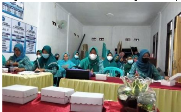
Figure 4. Smart Terrarium Making Workshop

The introduction to Digital Marketing and the training for creating terrariums brought about significant improvements in knowledge and technical capabilities, with a high level of enthusiasm exhibited by the participants or community members in Jatiwates Village. Regarding the production aspect, the Community demonstrated their ability to craft terrariums using locally sourced materials from the Jatiwates Village environment, creating five terrariums.