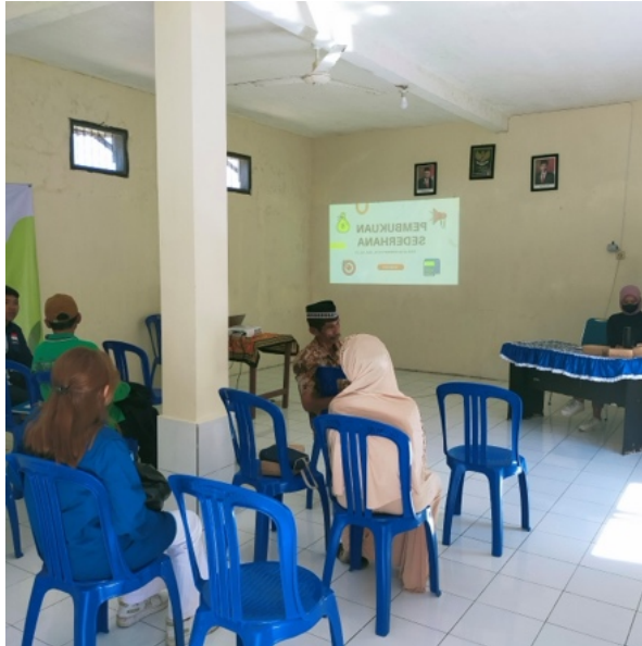
Figure 3. Farmer Group Discusses Simple Bookkeeping

The expected results of this training are not only limited to the level of individuals or farmer groups, but also contribute to the improvement of the overall village economy. With the increase in farmers' income and the increase in agricultural productivity, villages can experience sustainable economic growth. These positive impacts can include the creation of additional jobs, the improvement of people's purchasing power, and the development of village infrastructure. In addition, this training can act as a model that can be adopted by other farmer groups in the region. By demonstrating success in improving financial management and farm efficiency, this training can motivate other farmer groups to follow in his footsteps. Overall, the results of this training activity will help lift the quality of life of farmers, increase the economic resilience of villages, and encourage sustainable agricultural development. This reflects valuable investment in rural development and improved welfare of agricultural communities.