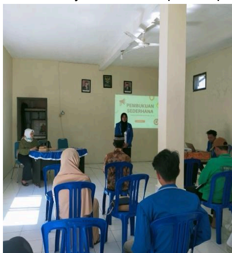
Figure 4. Q&A by Farmer Group and Speakers

In addition to tangible economic benefits, the results of this training can also change the attitudes and mentality of farmers. They may become more proactive in seeking new