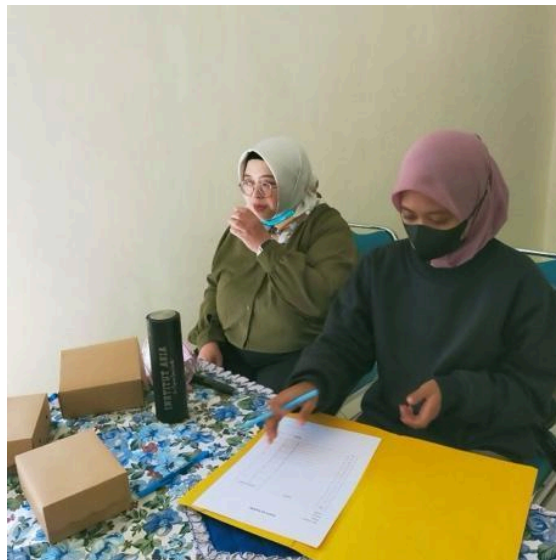
Figure 2. Training Preparation

In addition to practical results, this training is also expected to create a long-term impact on the farmer group of Rembun Village. Farmers will become more independent in managing their own finances, able to identify opportunities and challenges, and make more strategic decisions in their farms. The sustainability of agricultural business will help them to deal with market fluctuations and changing economic situations. With a sustainable approach, farmer groups will continue to improve their agricultural performance and productivity, which in turn will support local economic growth and improve the quality of life of