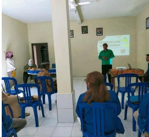
Figure 5. Head of Farmer Group Conducts Bookkeeping Demonstration

In addition, the results of this training will create a domino effect at the community level. Farmers who have undergone this training can share the knowledge and skills they have gained with their fellow farmers. This will create a culture of knowledge sharing and collaboration that will strengthen the unity and sustainability of the agricultural community of Rembun Village. In the long run, this positive impact can lead to the development and solidification of the agricultural sector in the village, with an impact on community welfare and sustainable economic growth. The outcome of this training, therefore, is more than just skills debriefing, but rather an investment in positive change and long-term improvement in the village.