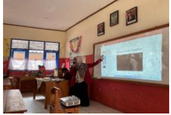
Figure 2. Presentation on Microsoft PowerPoint Material

The community service activity was attended by 10 teachers from Lembang Public Elementary School. The training took place on Wednesday, August 22, 2023. The session began with presentations from the speakers on Microsoft PowerPoint and Canva, followed by hands-on practice.