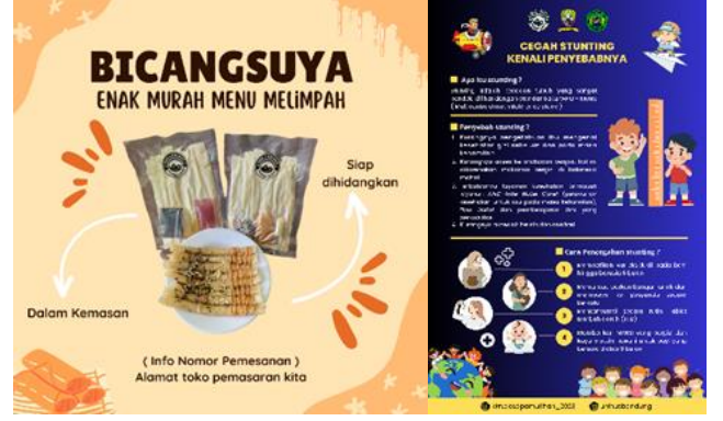
Figure 7: Learning media in the form of posters created by participants' creativity during the training

Universally, the workshop activities proceeded very well. Participants were highly enthusiastic and attentive to the presented material. They followed each training step according to the guidelines provided by the facilitators. Participants effectively created PowerPoint presentations, with many seeking clarifications on various aspects. This demonstrates their genuine interest and enthusiasm in producing their work.