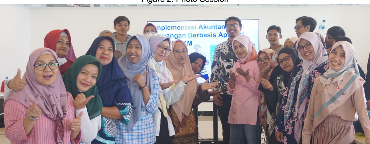
Figure 2. Photo Session