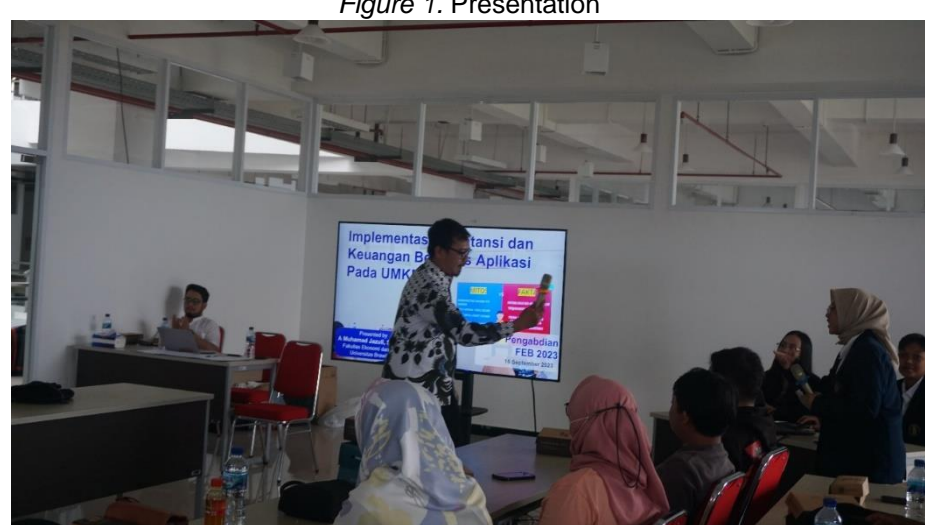
Figure 1. Presentation

The training methodology employed involves presentations and interactive questionand-answer sessions. As an initial step in the training process, participants are equipped with printouts of the Lamikro application usage material. This approach provides participants with a preliminary understanding of the day's topic. The outcomes of this method are twofold: Firstly, it enhances the participants' comprehension of the Lamikro application, which is readily available for free download on Android devices. Secondly, it enables participants to apply their knowledge of recording Micro, Small, and Medium Enterprises (MSME) financial bookkeeping in their everyday lives. However, it is noteworthy that there is a need for further training to fully master these skills. The training session was a blend of various activities. It commenced with a presentation delivered by the first speaker (refer to Figure 1). This was followed by a group photo session involving the training participants and the speaker (refer to Figure 2). The session concluded with a demonstration of the initial interface of the Lamikro application (refer to Figure 3).