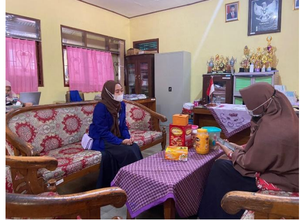
Figure 1. Observations and Interviews of English Subject Teachers

The steps of this service research include of planning, implementing, and evaluating activities. During the planning phase, researchers conducted observations and interviews as outlined. During the implementation stage, researchers conducted actions that were categorized into two parts: (1) creating a pictorial publication. The production of the picture book was conducted at the student Real Work Lecture position for a duration of two weeks, commencing with the generation of ideas, followed by the composition of ideas and story scripts, creation of illustrations, and concluding with the printing of the book. The program was implemented by introducing picture books to class VI students at SD Negeri 2 Pandeyan. This was done by distributing the books and allowing the students to read together using the read aloud approach. Activities are conducted to educate children about the significance of cultivating non-academic literacy in order to foster their imagination and critical thinking skills, as well as enhance their understanding and social awareness. During the evaluation phase, the researcher asked sixth-grade students from SD Negeri 2 Pandeyan to engage with the message provided in the tale. The session concluded with students reflecting on their own thoughts and considering how to apply the content of the distributed picture book. Researchers also assess the program in terms of its aims and the actual execution that was done.