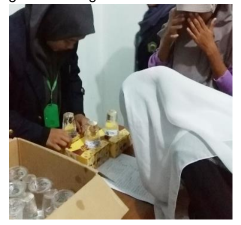
Figure 2. Filling out the attendance list

Overall, the socialization and training activities proceeded smoothly, primarily due to the substantial support from the hamlet, which provided the necessary facilities and resources for the engagement, along with the enthusiastic participation of the local community members. The activities were conducted in four sessions. Before commencing the program, the audience was directed to sign in as proof of their attendance in the socialization activity. It was noted that a total of 23 individuals attended the socialization session.