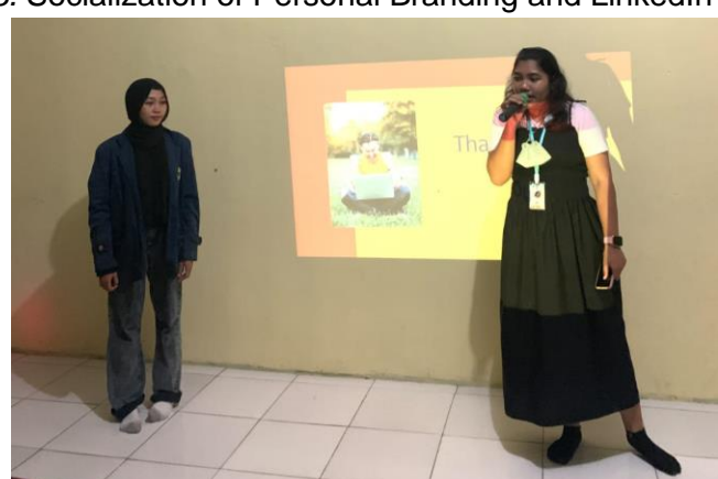
Figure 3. Socialization of Personal Branding and LinkedIn Platform

required skills, an explanation of how to write job application letters and CVs, and job application tips.