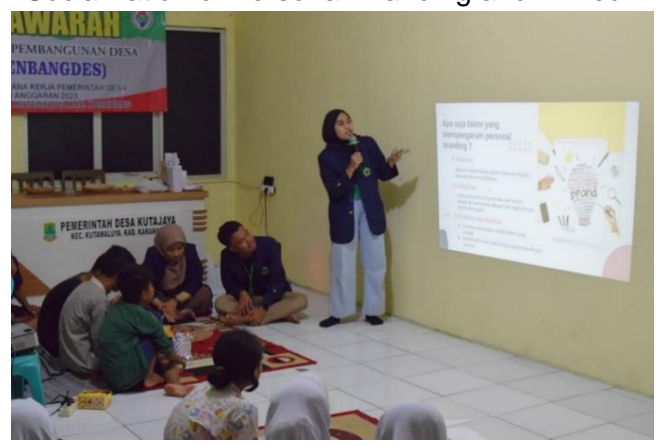
Figure 4. Socialization of Personal Branding and LinkedIn Platform

Subsequently, the second session involved the socialization of materials highlighting the importance of personal branding to establish a favorable self-image and introduce the LinkedIn branding platform. Both the first and second sessions of the community engagement activity progressed smoothly, owing to the high enthusiasm displayed by the audience in participating in this program.